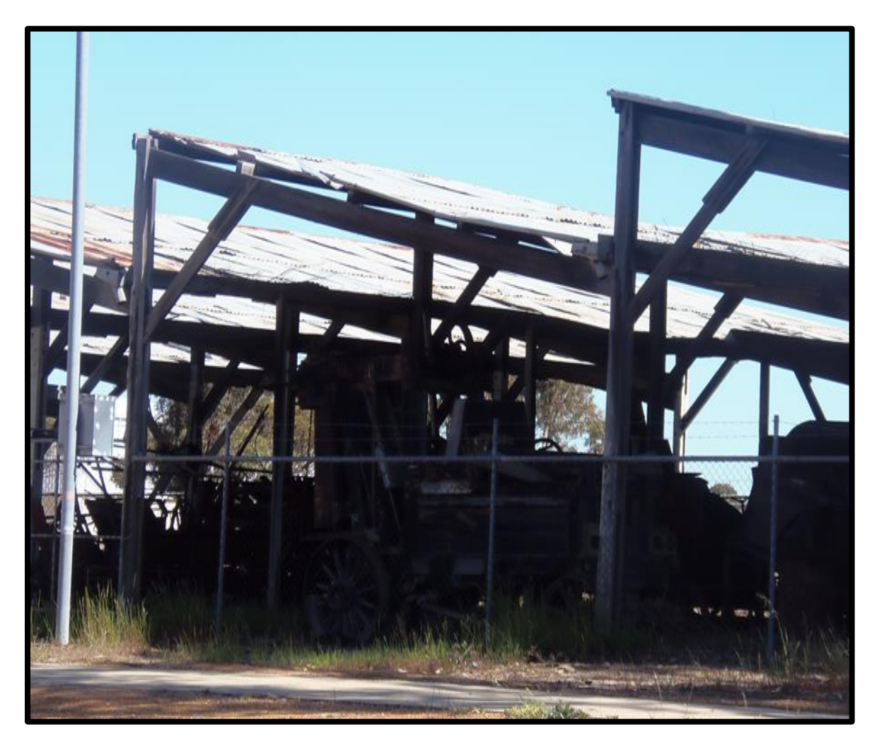
Tractor Park – A place on the MHI.

The Heritage Strategy should be reviewed in full every five (5) years.