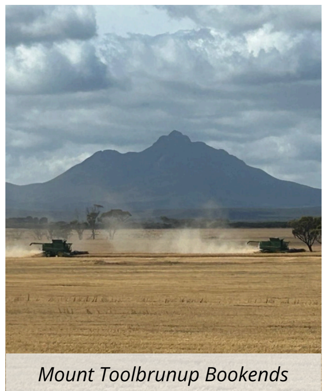
Mount Toolbrunup Bookends