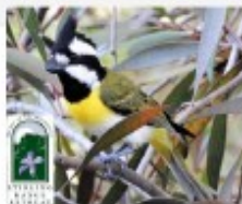
Hidden Treasures Dawn & Dusk Bird Walks