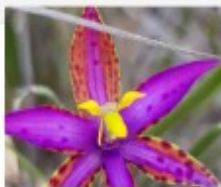
Hidden Treasures Orchid & Wildflower Tours