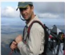
Mt Trio Guided Wildflower - Orchid Walks